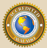
Accredited Health Care Institute of Mexico