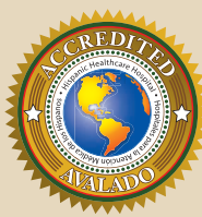
Accredited Health Care Institute of Mexico