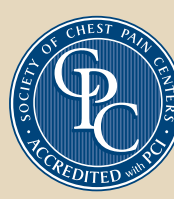
Accredited Chest Pain Center