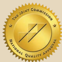
Primary Stroke Center Certification

1310 McCullough Avenue San Antonio, Texas 78212 210-757-2200 www.SAHealth.com