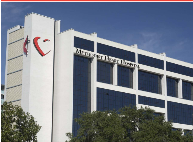
*A Methodist Hospital Facility